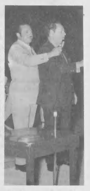
Sportsman of the Year trophy from ASU Pre ASU week opening of Stadium. At right, ou